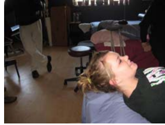
Lift head up slowly, chin tucked, teeth and jaw aligned, slowly lower.